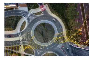
Transport The EU will support all modes of green, smart and safe transport