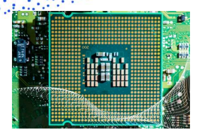
Digital The EU will support open and secure internet