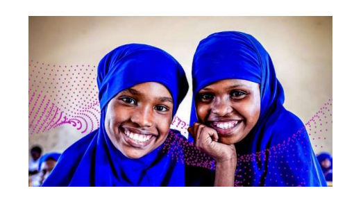
Education and research The EU will invest in high quality education, with a focus on girls and women and vulnerable groups