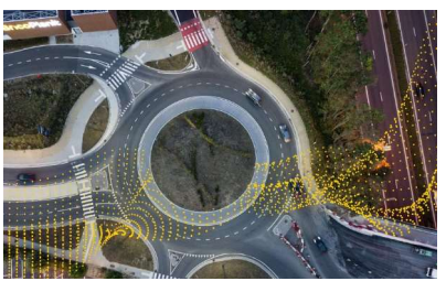
Transport The EU will support all modes of green, smart and safe transport